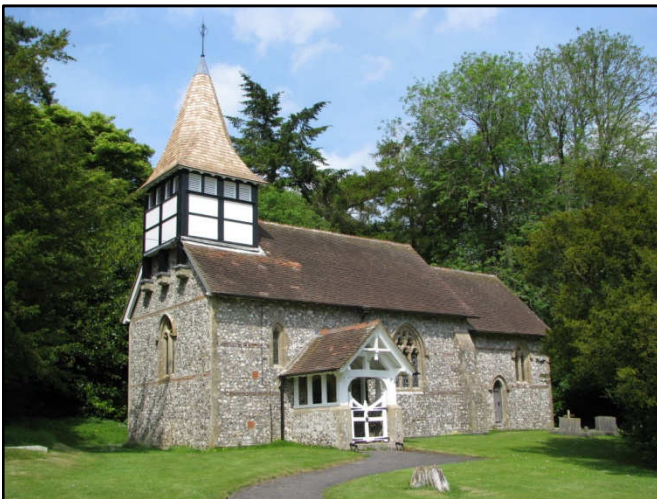
The Linkenholt village church