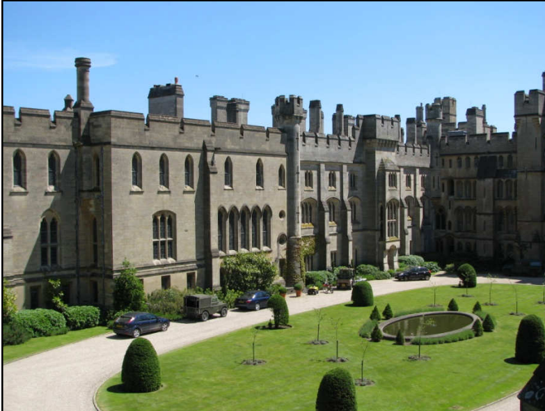
The interior courtyard (bailey) of Arundel Castle.