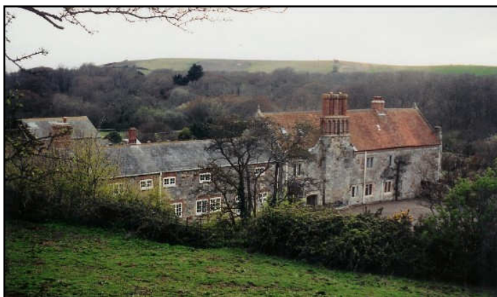
Kingston Manor in 2001. The original Manor house is on the right. The left wing was added later. The photo was taken from the churchyard of St. James.

If you get the chance, there are many interesting sites to visit on the Isle of Wight, and the number of tourists is less than on the Isle of Britain.