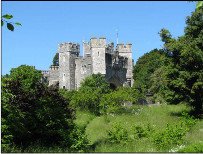
Arundel Castle distant view.