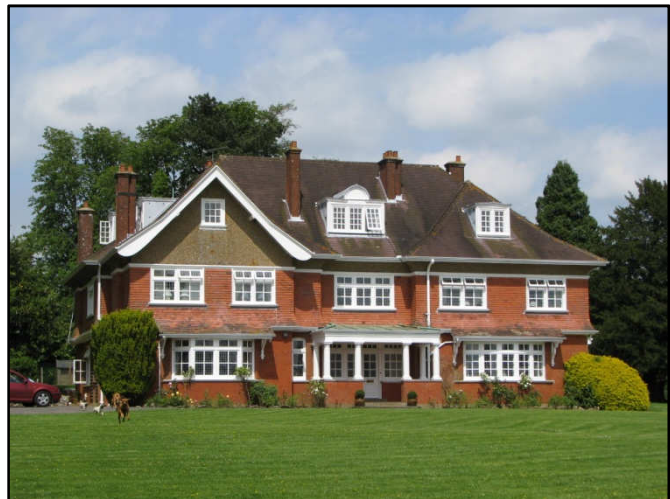
The newer Linkenholt Manor