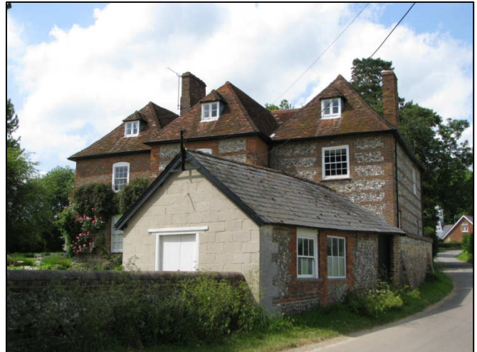
Old Linkenholt Manor from the side