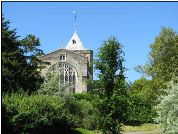
Fitzalan Chapel at Arundel Castle