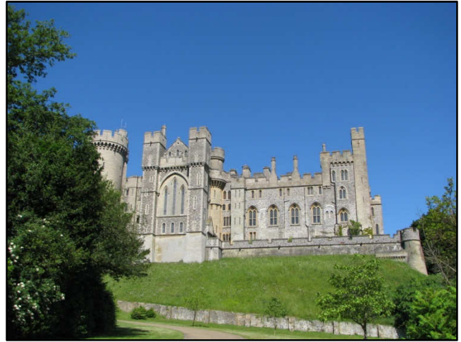
Arundel Castle view from below.