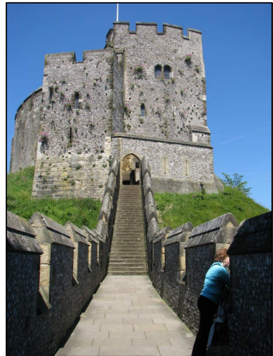
The first stone keep, built about 1140.