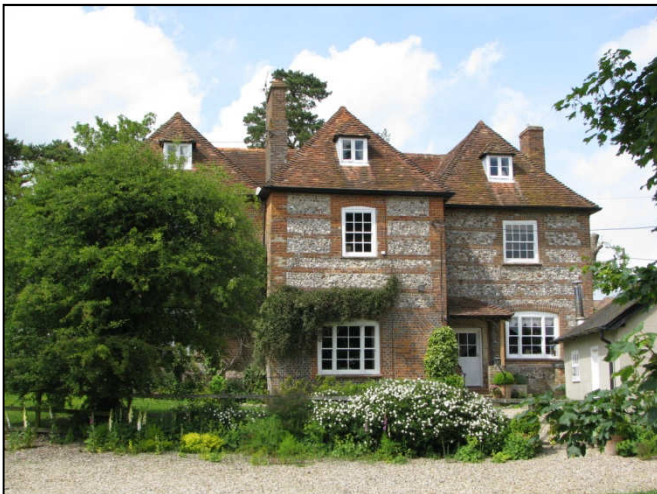
Old Linkenholt Manor from the front.

As it happens, we saw a two-page advertisement in a magazine about the sale of the entire estate and village of Linkenholt. The people at Linkenholt told us that they had heard it had sold. So all of the village (including 21 cottages) and surrounding lands (including 1,500 acres of farmland and 450 acres of woodland) are owned by the Linkenholt estate. If you visit there, the snack shoppe is across the street from the church and beside the polo field. Alice, who runs the snack shoppe, is quite helpful and enjoys visitors. The old manor house is one house (west?) from the only intersection in the village. You can Google "Linkenholt Manor" and see more photos.