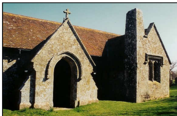
St. James Chapel on the grounds of Kingston Manor.